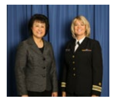
Oklahoma City Area, IPC Improvement Support Team, Oklahoma City Area

For improving care through the creation of a model program entitled Improving Patient Care Made Simple.