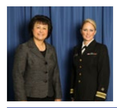
Patient Experience - Exceptional Results Group, Clinton Service Unit, Oklahoma City Area

For improved quality of and access to medical care through the advanced access patient-centered care model.