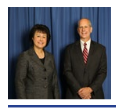
AANHS DHF & Seattle DES, Alaska Area

For outstanding leadership, skill, and initiative in contributing to the completion of Alaska health facilities projects.