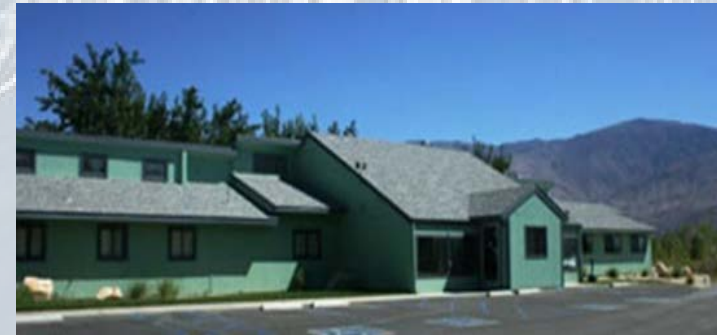
Lone Pine, CA