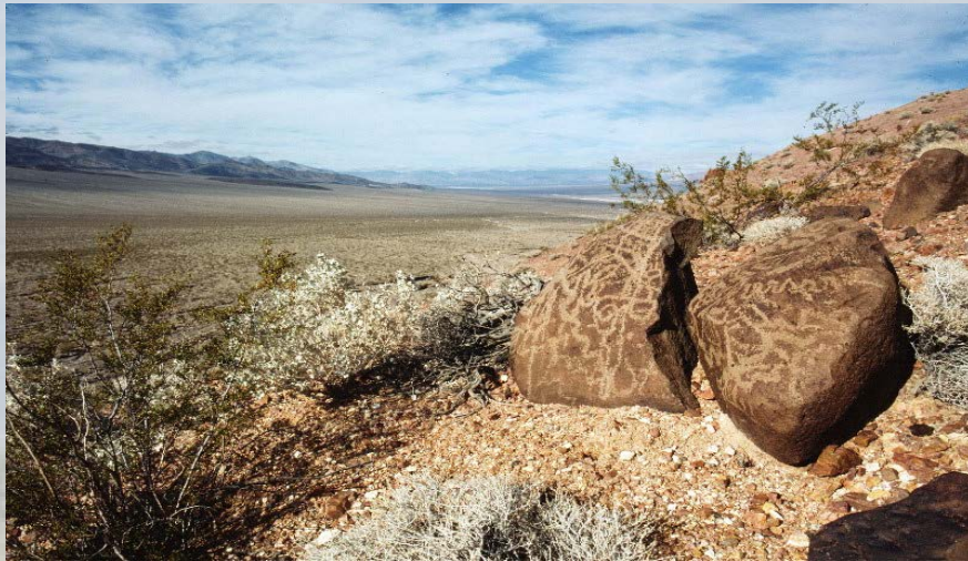
Death Valley, CA